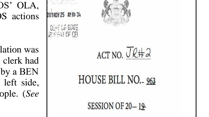
Figure 1 - Capture of Date, Time Stamp and Assignment of Joint Resolution Number for HB 963

Though BEN also has a single written procedure governing intake of Joint Resolutions (See Table 2), the OSIG found no similar color coding or demarcation used by DOS (like Bills sent to the Governor) to ensure proper routing and tracking of its movement within DOS [though the General Assembly delivers Joint Resolutions to DOS using a color-coded scheme that are maintained by BEN]. To the contrary, because Constitutional Amendments do not require action by the Governor, after a Joint Resolution is received, recorded, and assigned a number by BEN's clerical staff, a copy is made for the file, and the Joint Resolution is referred to a supervisor. [OSIG Note: Based on its review, it was unclear to the OSIG what, if anything, the "supervisor" did with Joint Resolutions.] A notification email is sent to a distribution list and the